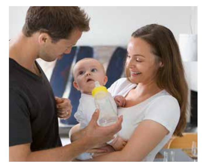
Among the toxic chemicals reverse osmosis also eliminates chlorine.

Our bodies need large amounts of the so-called macro minerals, which include calcium, iron, magnesium, sodium and potassium. Trace minerals encompass the likes of selenium, manganese, zinc and copper, for example.