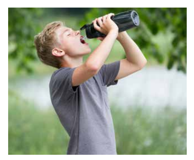
Tap and even some bottled water can contain chemicals, heavy metals, and potential allergens. Drinking Bluewater purified water minimizes your exposure to 99% of contaminants and may potentially reduce your allergy symptoms.

The International Water Association (IWA) notes that reverse osmosis systems efficiently remove between 90-99.99% of all contaminants, as well as trace minerals, from drinking water. And a large number of other water experts believe that the best way to significantly reduce water contamination is to use a reverse osmosis (RO) unit.