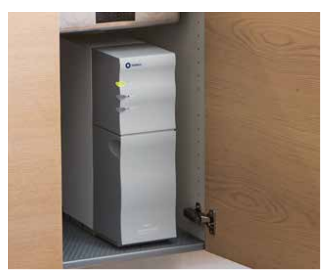
<u>The International Water Association</u> states that water filtered or treated by reverse osmosis is pure, clean, and healthy and free of most of the emerging contaminants such as prescription drugs and perchlorate as well as other contaminants like Arsenic, Cyanide, and Fluoride.

The London-based IWA, a leading international publisher of water, wastewater and environmental publications, stresses that consumers should not be concerned about the removal of minerals by reverse osmosis systems. It notes that 'WHO (2009) and WQA (2011) have pointed out that the human body obtains the vast majority of minerals from food or supplements, not from drinking water'.