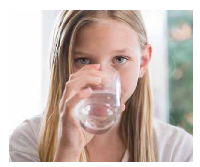
To receive enough minerals for our bodies from water, we would need to drink a bathtub of water every day, according to one information website.

We have found no hard scientific evidence that ingesting mineral-free purified water is harmful to the human body. Quite the opposite, reverse osmosis purified water is a proven way to remove health-threatening contaminants that may exist in tap water.