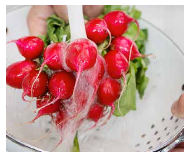
Good nutrition is not about the quantity of food we eat, but the quality of the food. The same applies to the water we drink.

A typical bathtub holds 80 gallons of water (just over 300 liters), while many health authorities recommend people should drink around eight 8-ounce glasses of water a day or half a gallon (2 liters on average).