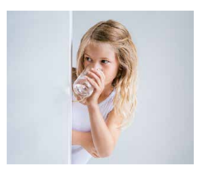
Our passion at Bluewater is to deliver contaminant free drinking water from the tap using the world best water purification technologies.

This white paper is based on a Bluewater article published in the Water Quality Products Magazine in Fall 2016 that examined the issues of emerging contaminants.