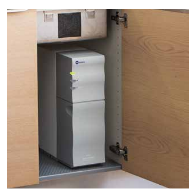
Bluewater's premium water purifiers harness patented SuperiorOsmosis™ technology to filter tap water efficiently and slash unnecessary water wastage.

Consumers around the world want safer, cleaner drinking water like never before. Yet today's traditional water treatment systems often use parameters established many years ago, based on conditions and knowledge available at that time. As this white paper notes, there are a host of new chemicals, pharmaceuticals and other contaminants that municipal water treatment systems in many areas of the industrialized and developing world were not designed to eradicate. From Swiss lakes to Canadian streams to aquifers deep underground, you will find water being 'poisoned' by a cocktail of hormones, antibiotics and other contaminants in ever growing amounts.